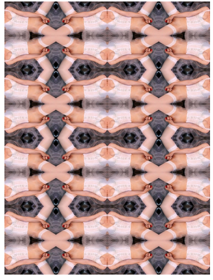
'Sex-mirror # 4' Virginity fantasy

It is an open comment on the manipulated body, the object and the subject of urges, the victim - to the point of submitting itself to aesthetic surgery- of established values.