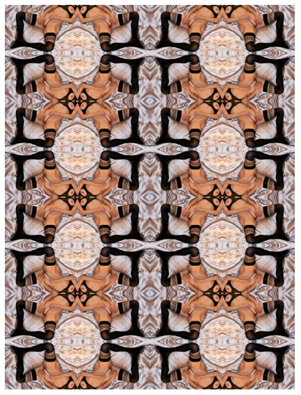
'Sex-mirror # 35' Latex fantasy